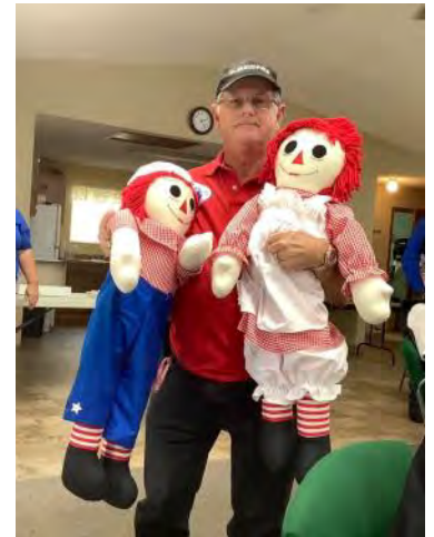
Future Michigan District Directors