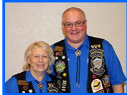
Senior Michigan District Directors