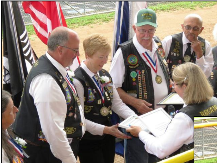
Individual of the Year

Make sure you list them in your chapter newsletters!